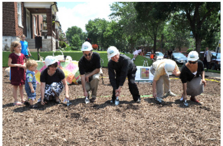
Community organizers at the groundbreaking ceremony.