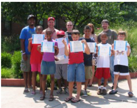
Recent graduates of BWorks proudly show off their diplomas.

BWORKS, as always, is looking for volunteers, primarily to instruct neighborhood kids in its three areas of expertise: bicycle safety and maintenance [BicycleWORKS], computer literacy [ByteWORKS], and writing and illustrating books [BookWORKS]. But there are other, non-teaching volunteer opportunities as well, including one-day-only affairs. Everything you need to know about volunteering can be found at http://www.bworks.org/ .