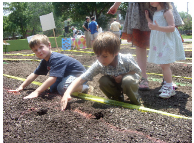
Children planting pumpkin seeds.