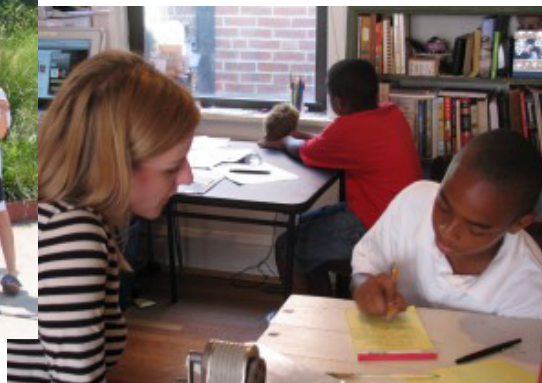
BWorks depends on the kindness of volunteers.

BicycleWORKS has just begun adult classes on Tuesday nights! Classes are free to volunteers or a $5 donation. Class are about an hour long, starting at 7 p.m., leaving plenty of time to try volunteering from 8 p.m. to 9 p.m. One topic will be covered in each class.